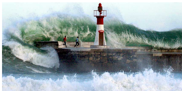
Fig. 3. A wave over 9 m washed two people off the breakwater in Kalk Bay on 26 August; photo by P. Massie (Hunter: http://www.weathersa.co.za/Pressroom/2005/2005Aug31ExtremeWaves.jsp , 2005).

Another 965-foot cruiser with more than 2000 passengers on the way from the Bahamas to New York was struck by a rogue wave at least 21 m height. The wave flooded cabins, injured passengers and forced the liner to stop for emergency repairs: “It was pure chaos! Our captain, who has 20 years on the job, said he never saw anything like it”, as people