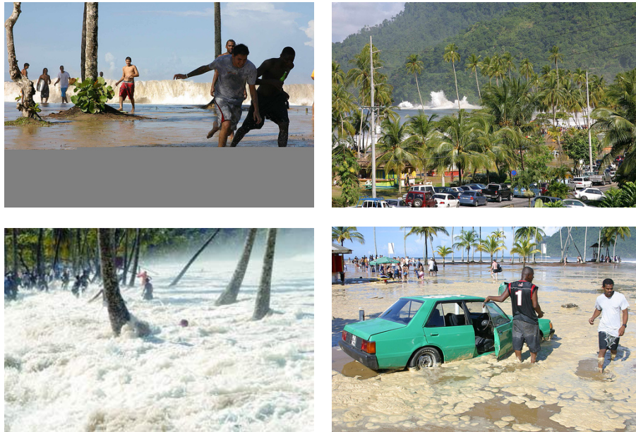
Fig. 4. The waves in Maracas Beach on 16 October (Stapleton, 2005).

waves about two times (1 m against 40–50 cm), passed the boat and broke at the coast (Ermakov and Vasilinenko, 2005).