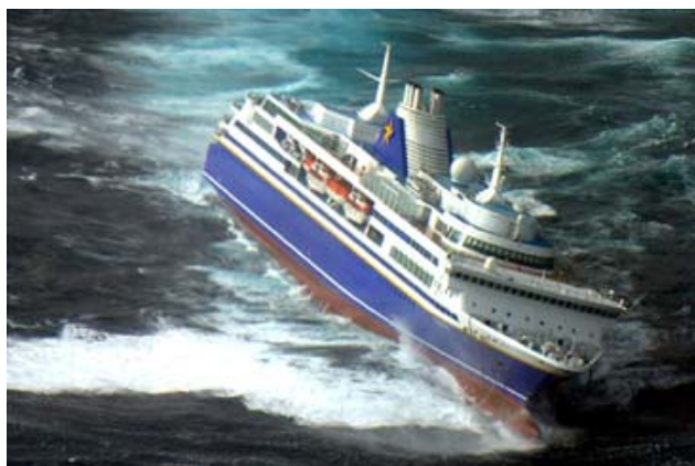
Fig. 2. The cruiser “Voyager” damaged by a 15-meter wave on 14 February (Schwabedissen and Walter: http://www.esys.org/news/grand_voyager.html , 2005).

and CNES), Envisat (CNES and ESA), GFO (NOAA) with global geographic coverage. The lowest resolution is 1^\circ Mercator grid. Near-real time data are produced twice a week. The description of all the data, its processing, reliability and data sources are provided on the website. We analyze the data from each satellite and find the maximum wave from all satellites.