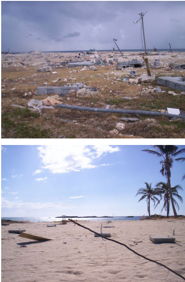
Fig. 5. The Bahamas, rocked by a big wave on 24 October (National Geographic News, 2005).

greater number of potential witnesses, and a higher rate of dubious accidents. Figure 1 shows the locations of the events in 2005 suggested (dots) and selected (stars) as true freak wave events. The number of accidents near the shore remains greater (six events against three in the open sea).